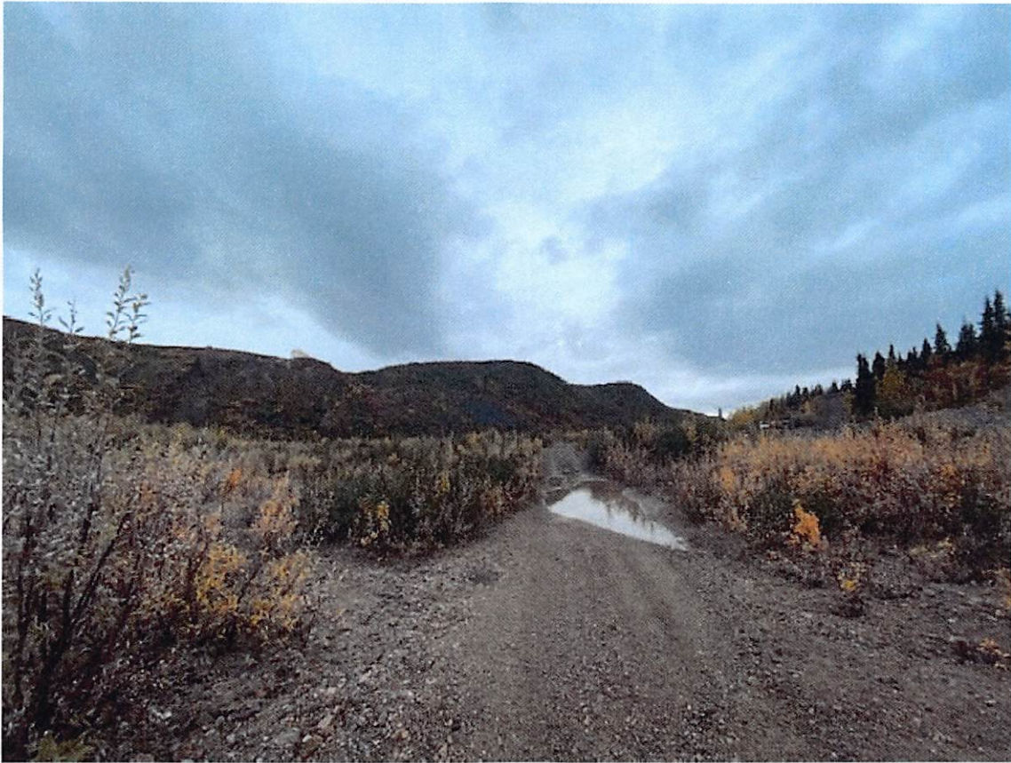
Photo #5: Taken from the same location as photo #4, but facing downstream. Note the firm gravel terrain.