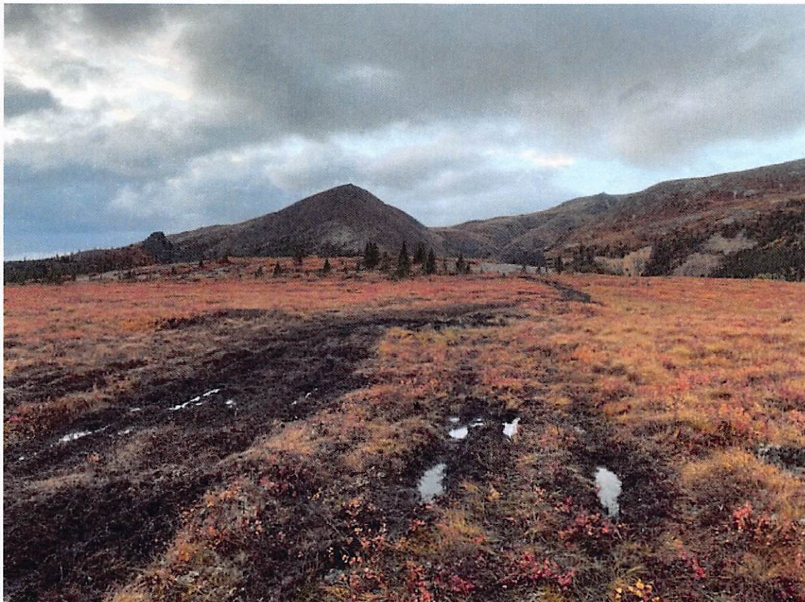
Photo #2: Trail departing from the mining road near Needle Rock. Hills in the background would be included in the proposed boundary modification.