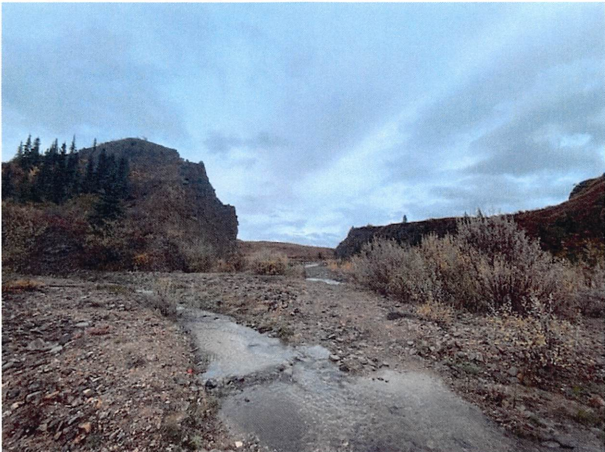
Photo #4: Section of the mining trail, just below the mouth of Surprise Creek, looking upstream. This trail is currently in the Wood River CUA and would become available during hunting season if the boundary proposal passes.