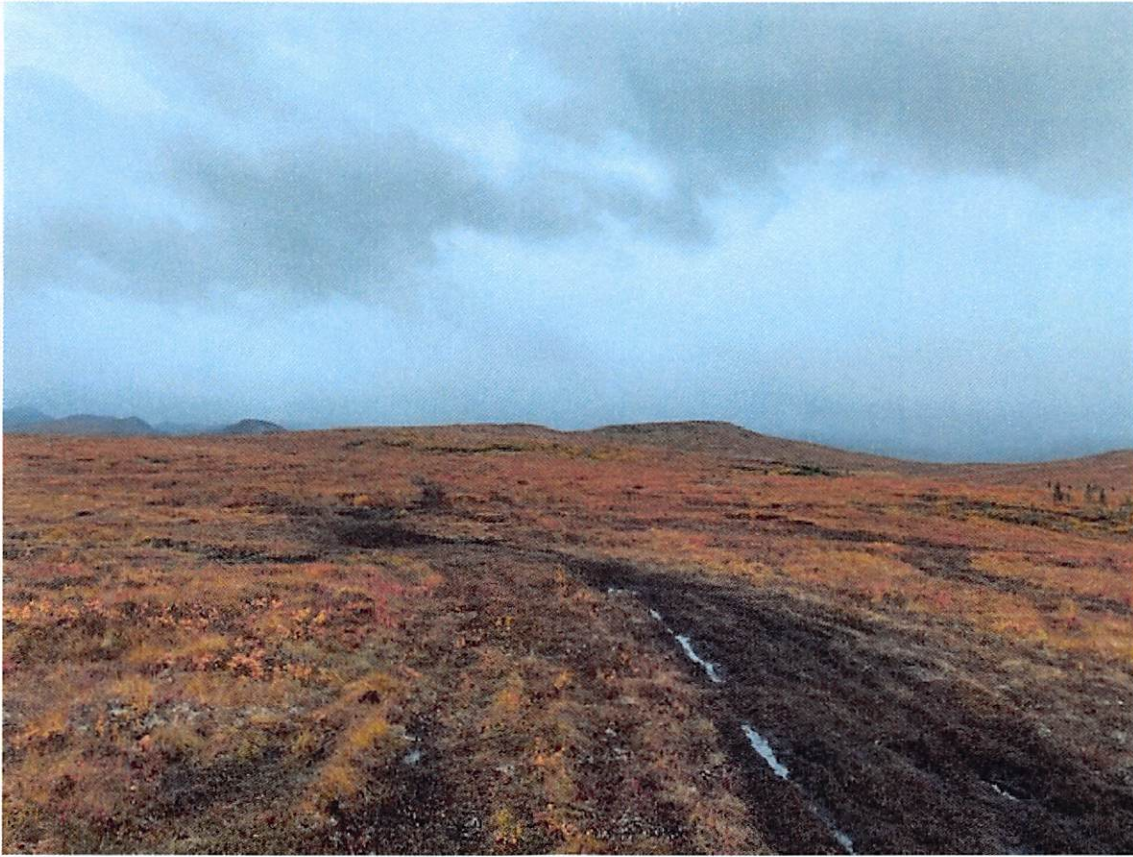
Photo #1: Damage to the tundra due to hunter's avoidance of non-motorized area. Needle Creek in the background.