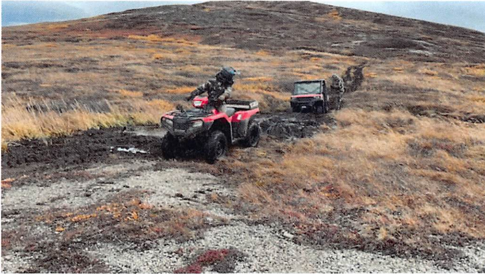
Photo #3: ATVs struggling in the soft tundra. Proposed boundary change would keep this traffic on the firm gravel riverbed, where the existing trail is maintained by area miners.